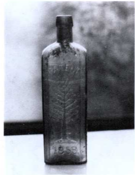
Wishart's Pine Tree Tar Cordial, deep emerald green, large size.

back wall half in and half out of the privy (again). We dug forward and down, digging through alternate layers of clay and ash. Our expectations growing with each bucket full.