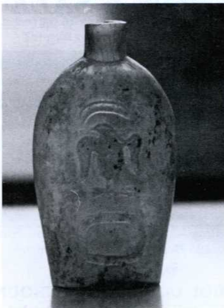
Double Eagle historical flask in half pint size.

which is our usual habit until we are certain of what we are digging into. As the initial hole was widened, large amounts of rock slowed our progress. It became quickly apparent the rocks were stacked on top of one another forming a wall. #@*%$#@!!! Anyone who has done a fair