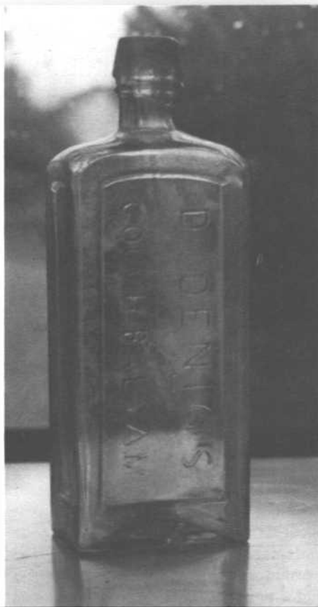
Extremely rare and unlisted in this size. 'Dr. Denig's / Cough Balsam', aqua, iron pontil. The best bottle found in both yards.