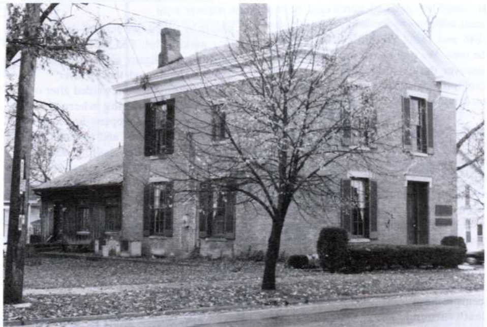
The Lawyer's house.

did not go as deep as the privy it bisected. It intruded into the wood-lined hole only about six to eight inches. The mouth of an undamaged Wishart's Pine Tree Tar Cordial was pressed up against the bricks and a pontiled umbrella ink was found behind the brick wall. Apparently the builders were not aware of privy #2 when they first dug the hole for privy #3. Sadly, it was new, shallow, and produced no bottles. The only fortunate aspect was we did not have to dig a new hole to discover this as we just broke through the brick wall. We vowed to return as soon as possible to help our friends settle their argument.